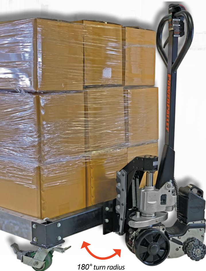
180° turn radius