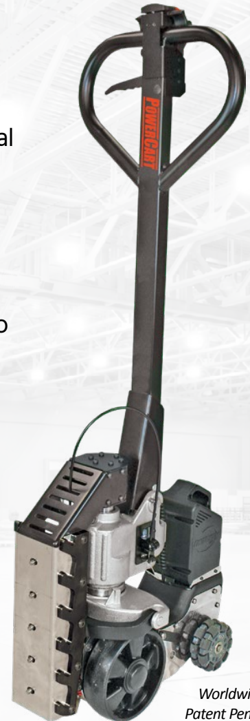
Worldwide Patent Pending

Connecting via the custom mating cart hitch, (one hitch attached to each cart) it allows a single operator to effortlessly move wheeled loads weighing up to 3,000lbs.