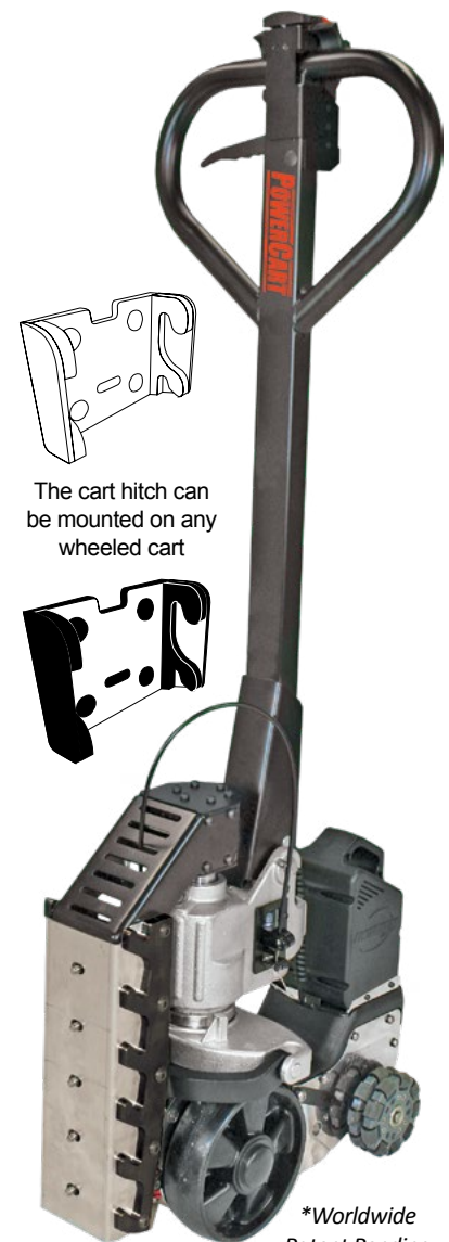
The cart hitch can be mounted on any wheeled cart

SAFER TO USE: A unique feature of the PCH is its automatic pin locking system that ensures a secure connection between cart and mover. A spring-loaded pin locks the PCH's hitch to the cart's hitch preventing the two from separating - regardless of the terrain or use case. The locking pin is also automatically retracted when the cart is unhitched.