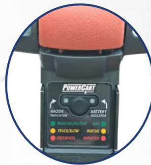
Multiple Speed Options and Safety Bump Stop